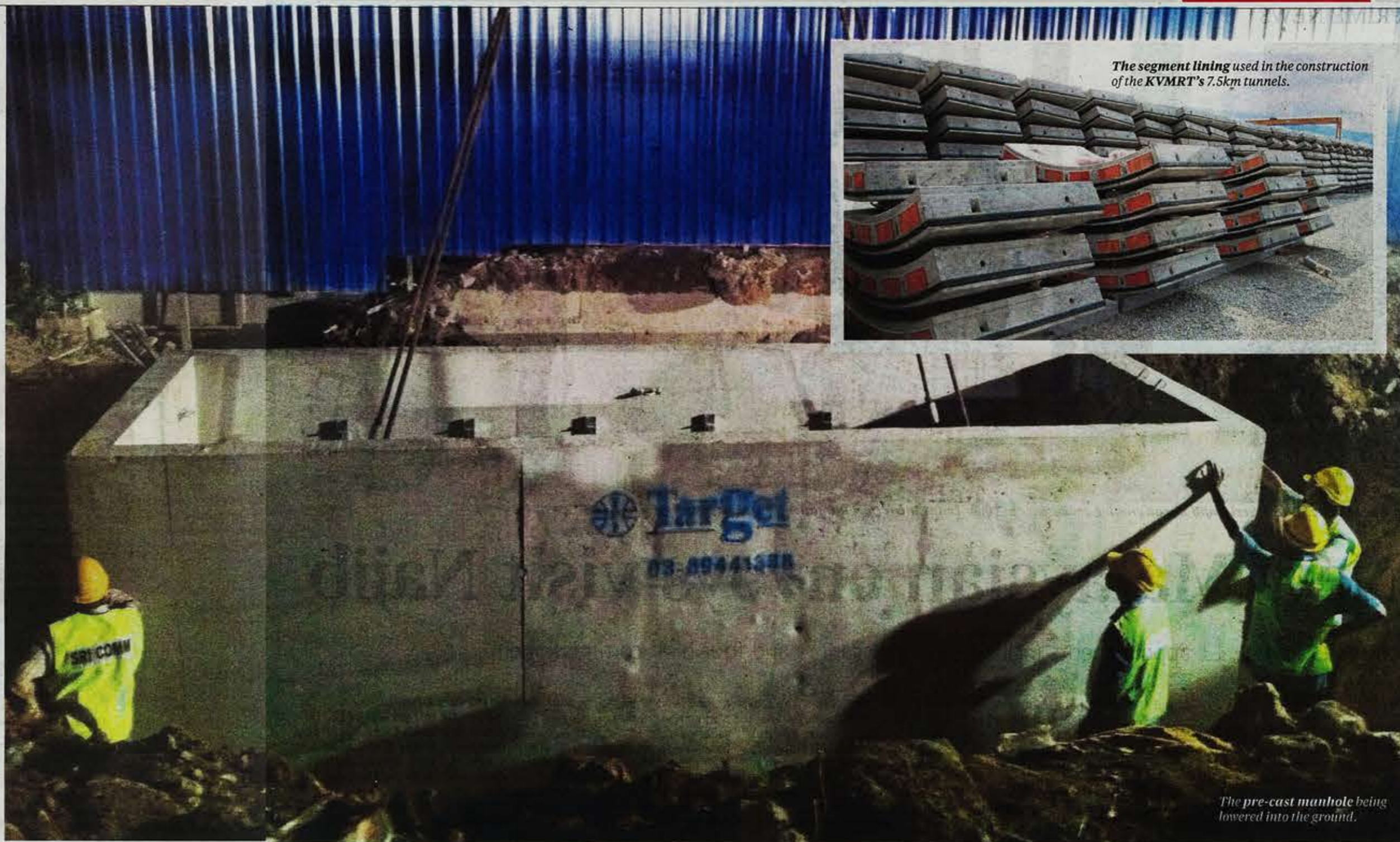
The segment lining used in the construction of the KVMRT's 7.5km tunnels.