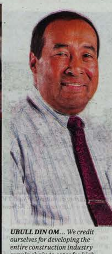
UBULL DIN OM... We credit ourselves for developing the entire construction industry supply chain to cater for high-value infrastructure, such as the KVMRT project, where local suppliers and service providers needed to enhance their capability